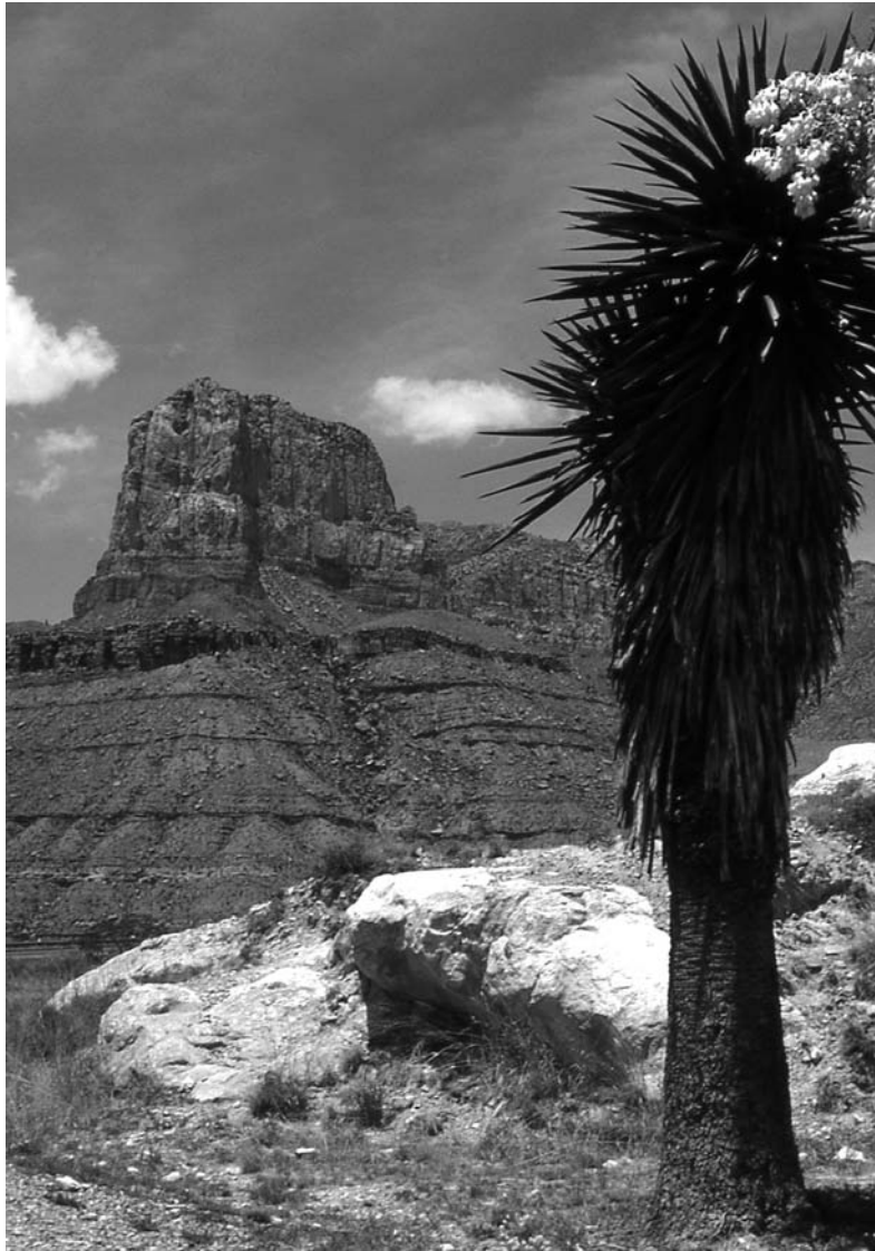
Figure 1.1 A view of the Guadalupe Mountains from the south. The massive cliff is limestone, part of the reef complex that grew here and throughout west Texas during the Permian. The older of the two pulses of extinction ended the deposition of the Permian reef.