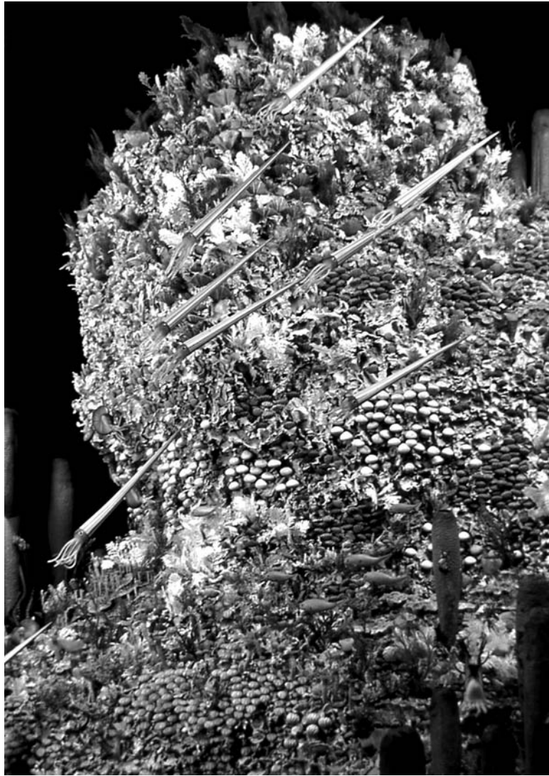
Figure 1.2 A reconstruction of the Permian reef of west Texas based on over forty years of research at the National Museum of Natural History. A school of nautiloids with a straight shell are passing in front of the reef. Most of the animals are various brachiopods, along with some bryozoans, sponges, and clams. Corals, one of the major modern reef builders, were almost absent from this Permian reef.