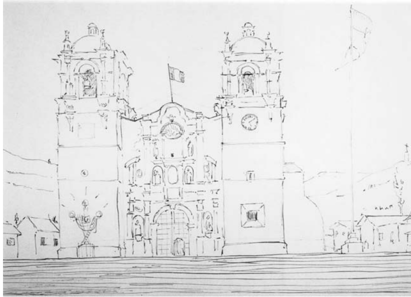
6. Puno Cathedral. In accord with principles of urban planning derived from the Roman architect Vitruvius and his Renaissance followers, the building overlooks the town's main square.

whether it was remembered, narrated in prose, recited in verse and song, or written down in books. For Spaniards in the Americas, none of this meant quite the same as it had done in the Peninsula and Europe. And for indigenous people, still different meanings emerged as they selected and rejected components from what was accessible to them of the unwieldy corpus of classical and Christian traditions that the Spanish in one way or another took for granted.