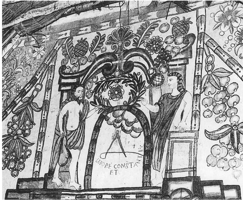
3. Hercules and Apollo flank the motto “By labour and constancy” in the church of Carabuco on Lake Titicaca in Bolivia. The church was decorated in the eighteenth century with imagery depicting classical, Christian, and contemporary scenes.

Vergil had written, which was not the same thing as what the reader of the translated text might expect. 26 There was something strange, something not immediately accessible about Vergil. Similarly, at the end of the fifteenth century, the humanist Antonio Nebrija in the footsteps of Italian humanists wanted to return to the Latin of the ancients: their vocabulary, syntax, and style. This meant that the Latin that was the vernacular of schools and universities, the Latin of medieval theologians, jurists, historians, and poets had to be disowned. 27 For what Nebrija, who viewed the Latin of the schools as an aberration, wanted