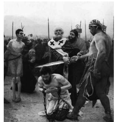
Figure 19 Ilya Repin, St. Nicholas Delivers Three Unjustly Condemned Men from Death , 1888, State Russian Museum, St. Petersburg, Russia