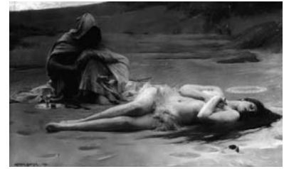
Figure 3 Arthur Hacker, Pelagia and Philammon , 1887, Walker Art Gallery, National Museums, Liverpool, UK

Writing early in the twentieth century, Clive Bell extended Schopenhauer’s radical version of Kant’s idea of disinterestedness even further when he declared that representation is altogether immaterial to art: “To appreciate a work of art we need bring with us nothing from life, no