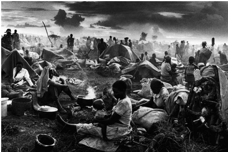
Figure 8 Sebastião Salgado, Rwandan refugee camp of Benako, Tanzania , 1994. © Sebastião Salgado / Amazonas / nbpictures