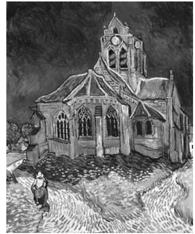
Figure 5 Vincent van Gogh, Church at Auvers-sur-Oise , 1890, Musée d’Orsay, Paris, France

The problem Addison faced is that if “but opening the Eye” is enough for beauty to strike, everyone whose eyes are working will perceive every kind of beauty—simple or complex, high or low, vulgar or refined—and its rewards at the same time. But that makes it impossible to separate the subtle appeal of the “serious” arts from the crude attraction of the “popular,” or, for that matter, the satisfactions of the arts generally from the seductions of the everyday. Imagine, for example, that Thomas Kinkade’s Dogwood Chapel seems to me as beautiful as Van Gogh’s Church at Auvers-sur-Oise (fig. 5, Plate 1 ) seems to you and that both of us experience the pleasure these works produce in the same amount of time. How can we now distinguish between the upper regions and the lower depths? How does the thrill I get from Kinkade differ from your admiration of Van Gogh? You may try to explain the difference by contrasting the harsh and emphatic brushwork of Church at Auvers-sur-Oise , which contributes to the sense of anguish that haunts Van Gogh’s late works, to the hazy