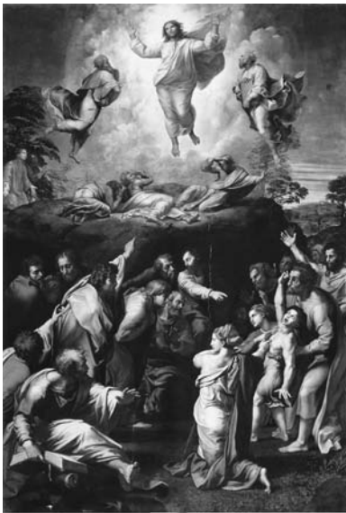
Figure 11 Raffaello di Sanzio (Raphael), The Transfiguration , 1518–20, Pinacoteca, Vatican Museums, Vatican State

(fig. 10) or even Raphael's visionary Transfiguration (fig. 11) are objectionable to people with particular moral, political, and religious sensibilities.