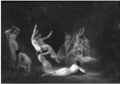
Figure 10 William-Adolphe Bouguereau, The Nymphaeum , 1878, The Haggin Museum, Stockton, CA