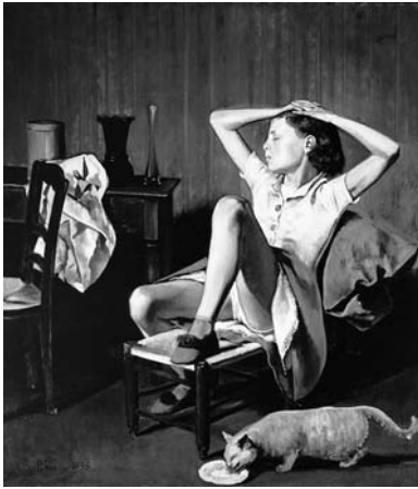
Figure 6 Balthasar Klossowski de Rola (Balthus), Therese Dreaming , 1938, The Metropolitan Museum of Art, New York

smoothness that seems almost designed to rob Dogwood Chapel of any hint of individuality. Its shifting, snake-like outline makes Van Gogh's church seem unstable and sinuous and gives it an air both threatened and threatening, while Kinkade's chapel, nesting comfortably within a postcard-like scene of stream, bridge, forest, and distant peaks, is what every tourist might expect to see in some country that doesn't exist during a trip that is never taken. Lit brightly from above, Kinkade's sky may remind the cultured viewer in you of Tiepolo or Luca di Giordano, but its only effect is to reinforce the picture's mawkish sense of comfort (God is in His heaven and all's well with the world), while the gradual darkening of the upper sky in Church at Auvers-sur-Oise announces an impending doom, perhaps Van Gogh's suicide barely a month after completing the picture. All that is fine. But is it more than just talk, unrelated to the original experience? If the experience of beauty is already complete, no sophisticated analysis can affect it, and the aesthete's urbane appreciation begins to look like a deceitful version of the lowbrow's sentimental bliss.