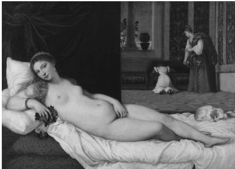
Figure 2 Titian (Tiziano Vecellio), Venus of Urbino , c. 1538, Uffizi, Florence, Italy

Everyone knows, of course, that works of art actually can elicit the most extraordinary reactions. Pliny tells us that Praxiteles' statue of the Cnidian Aphrodite caused such lust in one man that the stains that marked the consummation of his passion were still visible in the marble hundreds of years later. Titian's Venus of Urbino (fig. 2) is "the foulest, the vilest, the obscenest picture the world possesses," Mark Twain