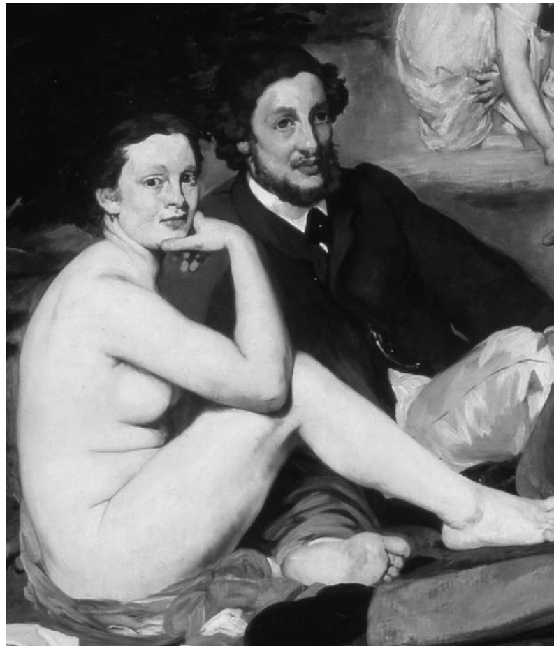
Figure 16 Edouard Manet, Le Déjeuner sur l'herbe ( Luncheon on the grass ), 1863, Musée d'Orsay, Paris, France

Bouguereau himself may have been thinking of another painter here: his bather is a tame, domesticated version of Victorine Meurent in Manet's Déjeuner sur l'herbe (fig. 16). Her semi-abstracted look is