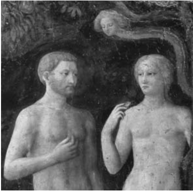
Figure 1 Masolino de Panicale, The Original Sin , c. 1427, S. Maria del Carmine, Florence, Italy

pleasures it promises began to seem dubious. Beauty itself was often taken to be the seductive face of evil, a delightful appearance masking the horrid skull beneath the skin. And even if it was not always the face of evil , once its connection with goodness was severed, beauty was still always a face (fig. 1), capable of promising one thing and delivering another: a mere surface and for that reason alone morally questionable. It became a feature and, if there can be virtues in appearance, a virtue of appearance and no longer a subject worthy of philosophy. Although the word continued to be used, beauty itself was replaced by the aesthetic, which, completely isolated as it is from all relationships with the rest of the world, promises nothing that is not already present in it, is incapable of deception, and provokes no desire.