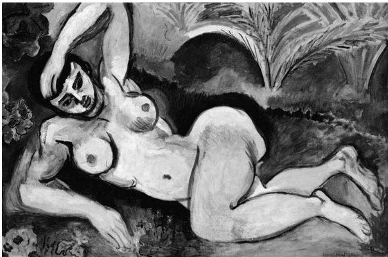
Figure 13 Henri Matisse, Blue Nude , 1907, The Baltimore Museum of Art: The Cone Collection, Baltimore, MD