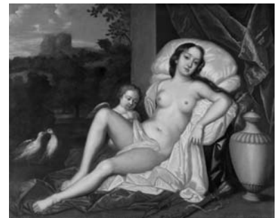
Figure 4 Sir Peter Lely. Portrait of Nell Gwynne [1650–87] as Venus, with her son, Charles Beauclerk [1670–1726] as Cupid (oil on canvas), Army and Navy Club, London, UK