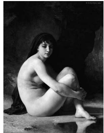
Figure 15 William-Adolphe Bouguereau, Seated Bather , 1884, the Sterling and Francine Clark Art Institute, Williamstown, Massachusetts, USA

The open picture plane and spatial recession of Bouguereau’s picture issue an invitation to the viewer and encourage him—this is primarily a painting for men—to enjoy the radiant sensuality of the young woman’s flesh, soft and bright against the dark craggy background. Exuding innocence and guile in equal parts, she seems aware of being watched, and her look is both somewhat embarrassed and also a bit gratified. Her legs are drawn close to her body, perhaps in an attempt to cover her nakedness, but her pose is too carefully arranged and her face is too composed to convince that she doesn’t realize that her right breast,