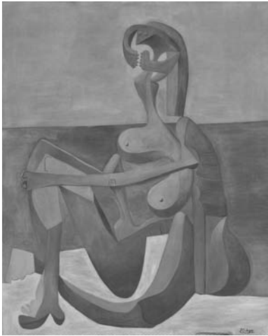
Figure 14 Pablo Picasso, Seated Bather [ La Baigneuse ], 1930. Oil on canvas, 64 ¼ x 51". Mrs. Simon Guggenheim Fund. (82.1950) The Museum of Modern Art, New York, NY, USA. Pablo Picasso (1881–1973) © ARS, NY.

When one says that Blue Nude is beautiful, one is merely expressing admiration for its strength and power, for Matisse's decision to present us with a powerful painting rather than a pleasant one, to draw our attention to the painting rather than to the woman. . . . One has . . . to work at seeing a painting as good despite its not being beautiful, when one had been supposing that beauty was the way artistic goodness was to be understood.