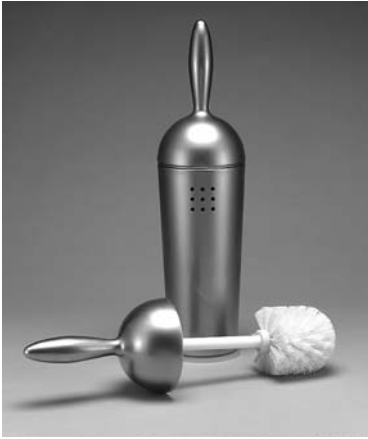
Figure 7 Michael Graves, Toilet Brush