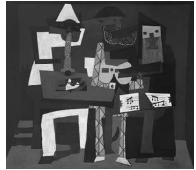
Figure 18 Pablo Picasso (1881–1973), Three Musicians , 1921. Oil on canvas, 6'7" x 7'3 ¾". Mrs. Simon Guggenheim Fund. (55.1949), The Museum of Modern Art, New York. Reproduced by permission from Art Resource, NY. Photo credit: © The Museum of Modern Art / Licensed by SCALA / Art Resource, NY

Greenberg has only contempt for kitsch, which relies essentially on representation, narration, and drama—features central to the traditional arts—but that doesn’t prevent him from admiring Giotto, Michelangelo and Raphael, Shakespeare, and Rembrandt—even the medieval artist who worked under the Church’s direction: “Precisely