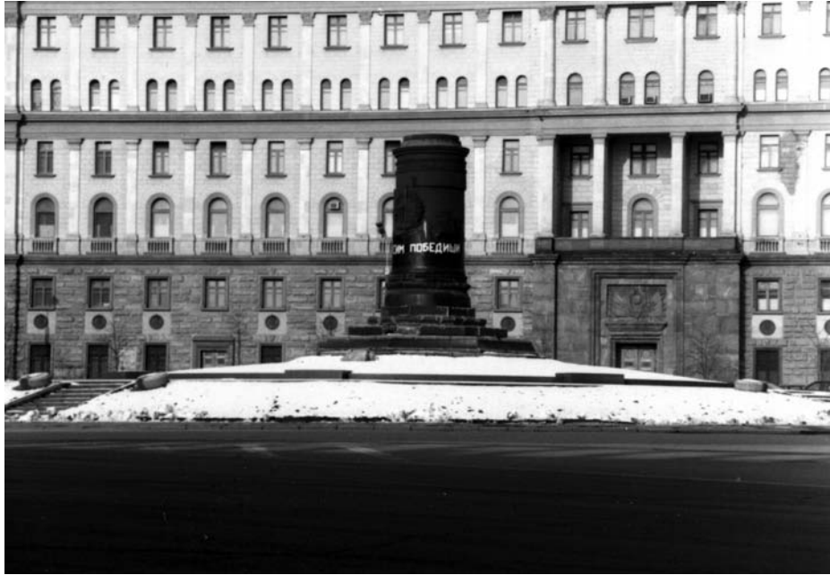
Figure 1.2 The crowd that toppled Feliks Dzerzhinsky’s statue on August 21, 1991, erected a homemade Orthodox cross on the pedestal and painted Sim pobedishi, the Old Church Slavonic equivalent of “By This Sign, Conquer,” on the plinth. Though the police immediately removed the cross, the graffiti still proclaimed the victory of Orthodoxy over the secret police in March 1992.

and its shrines were desecrated. Sim pobedishi paralleled two victories by the righteous over the evildoers separated by 1,679 years.