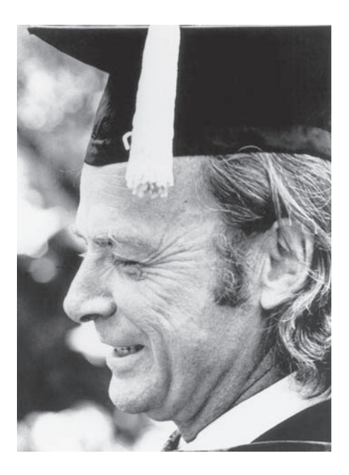
Figure 1.2 Richard Feynman, Caltech commencement, 1974.

they've been eliminated."<sup>4</sup> That is a high-minded and laudable attitude to have, but it is far beyond the capacity of most scientists. Most scientists are content to present their results without calling attention to all the ways they could be wrong (principle 6). Nevertheless, it's important for scientists to be careful to point out what could be wrong if they know it.