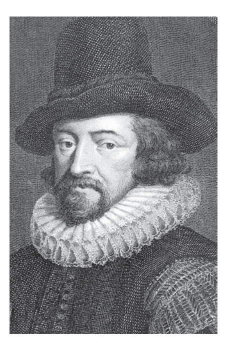
Figure 1.1 Engraved portrait of English philosopher and essayist Sir Francis Bacon, by Dutch engraver Jacobus Houbraken (1698–1780), Amsterdam, dated 1738, possibly after a portrait painting done circa 1731 by John Vanderbank (1694–1735).

Historians, philosophers, and those scientists willing to venture into such philosophic waters are virtually unanimous in rejecting Baconian inductivism as a general characterization of