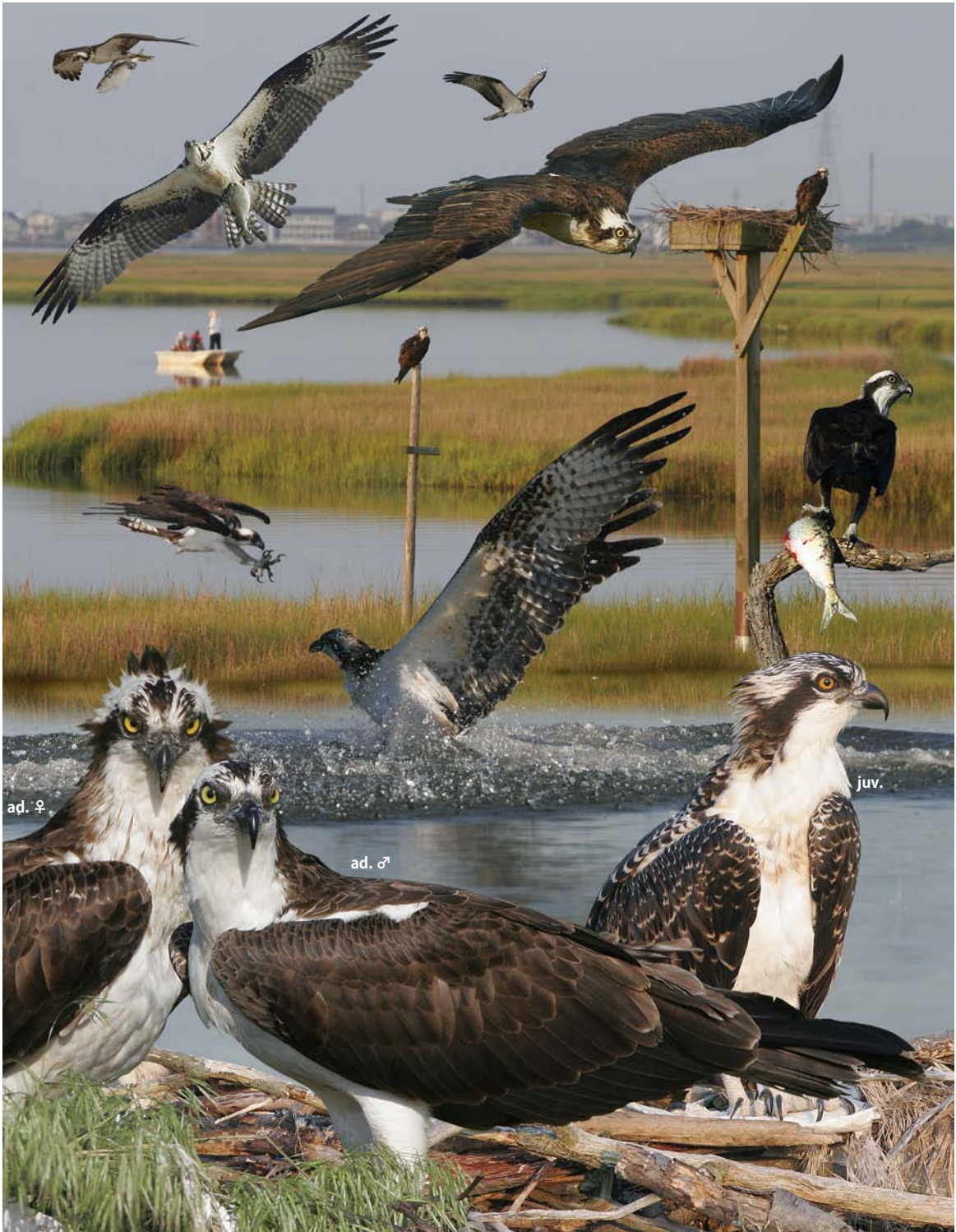
Osprey Pandion haliaetus OSPR L 23in