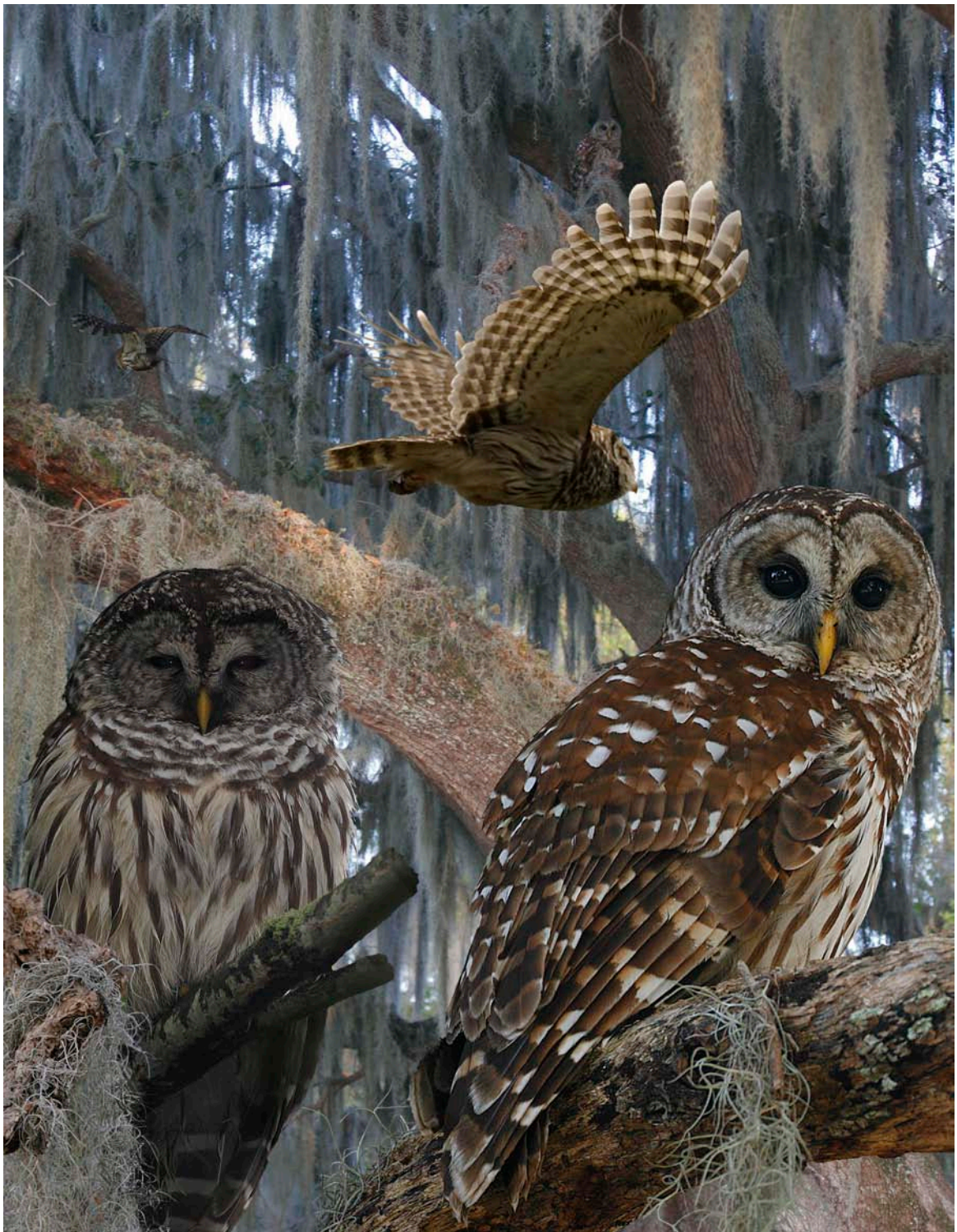
Barred Owl Strix varia BDOW L 21in